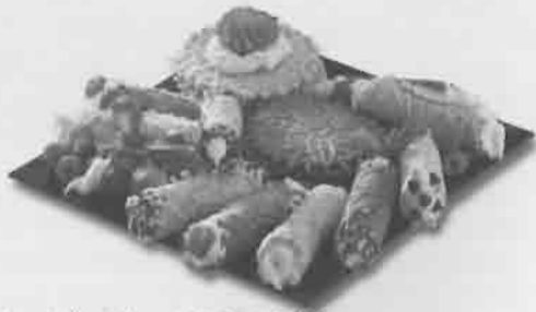
Figure 3. Cannolis and pizzelles are ideal for entertaining.

The round or cone shaped shells formed as described above can be filled with any of the following